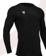
Base Layer Top (optional)