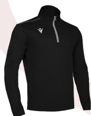
Havel 1/4 Zip Top (optional)