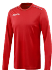
Rigel Shirt Long Sleeve (optional)