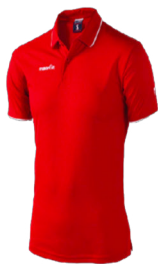
Draco Polo Shirt (Unisex Fit)