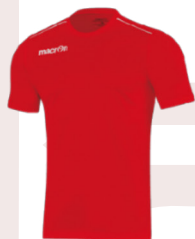
Rigel Shirt Short Sleeve